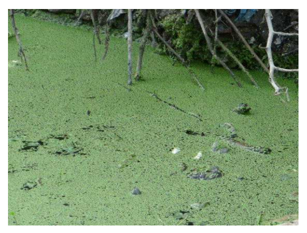
Fig. 1: The excessive phosphate-generated growth of algae / bloom in Lower Ganga Canal near J. K. Temple of Kanpur city.

Instead there should be a clause with warning that the product (detergent powder) must be phosphate-free, and the packets must also depict a sign like, "XP" (meaning, phosphate-free or no phosphate).